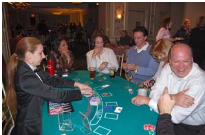
Guests gather around the blackjack table in hopes of winning some great prizes